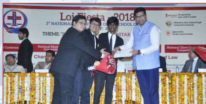
Moot Court Winners being Awarded in Felicitation