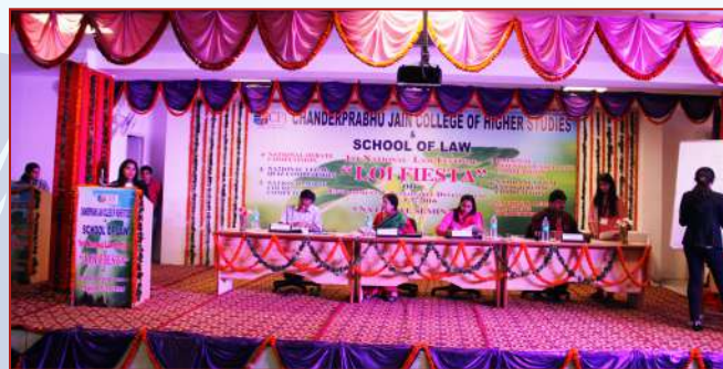
National Seminar in Progress