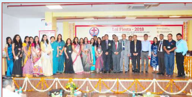
Guests & SoL Team at Valedictory Session of National Conference