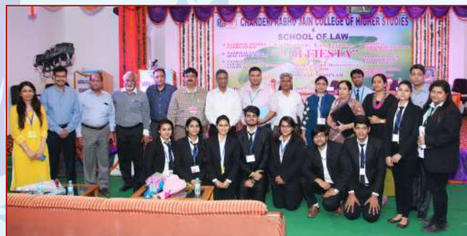
Organizers with Guests