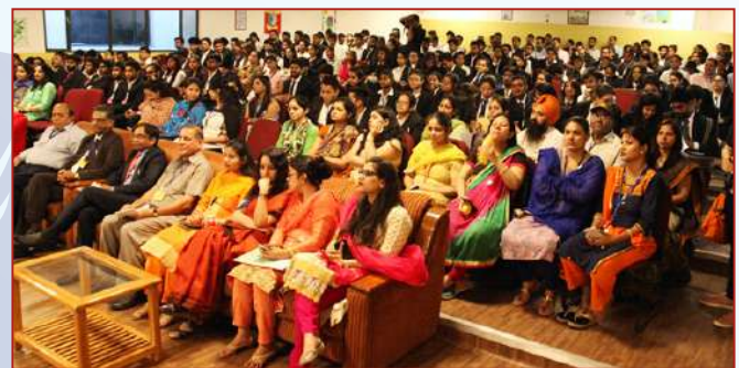
Glimpse of Audience @ LOI FIESTA 2017