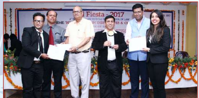
Moot Court Winners being awarded in Felicitation