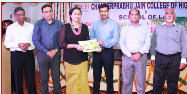
Felicitation of Participants