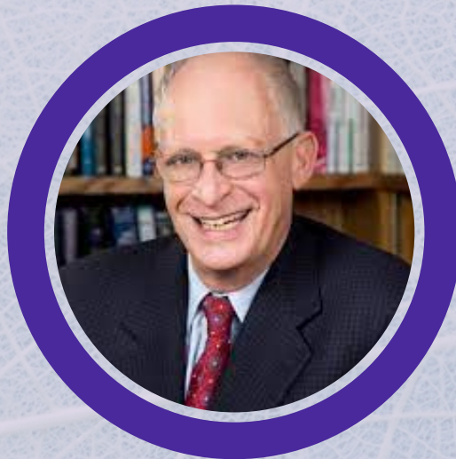
Prof. (Dr.) Oliver Hart

He is the recipient of the Sveriges Riksbank Prize in Economic Sciences in Memory of Alfred Nobel 2022 . He is Boatmen's Bancshares Professor of Banking and Finance at Olin Business School of Washington University, St. Louis.