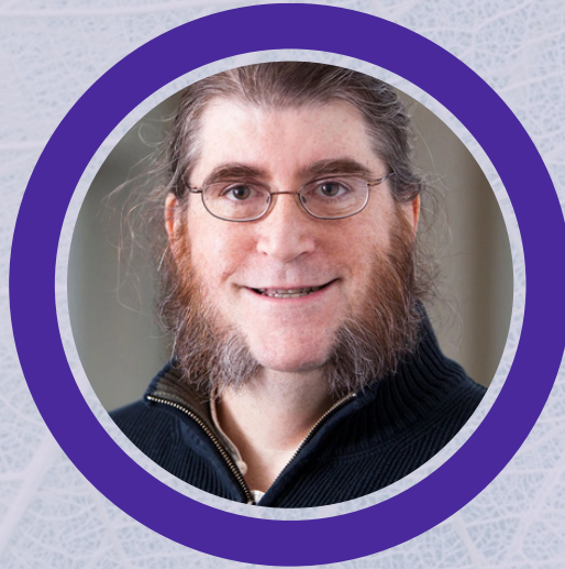
Prof. Philip H. Dybvig

He is the recipient of the Sveriges Riksbank Prize in Economic Sciences in Memory of Alfred Nobel 2022 . He is Boatmen's Bancshares Professor of Banking and Finance at Olin Business School of Washington University, St. Louis.