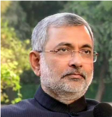
Hon'ble Mr. Justice Kurian Joseph