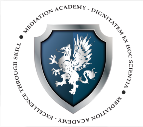
MEDIATION ACADEMY, SA