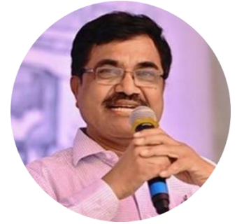
DR. ANAND TELTUMBDE

Dr. Teltumbde is a scholar and a civil rights activist. He has written extensively on the caste system and has advocated for Dalit rights. He is a highly qualified professional who enjoyed a successful career in management before becoming an academic. He is also a long time contributor to Economic and Political Weekly where he writes a column titled 'Margin Speak'. His writings combine an Ambedkarite perspective with a Marxist understanding of political economy, and highlight the failure of the Indian Republic in seriously confronting the challenges of caste violence and injustice.